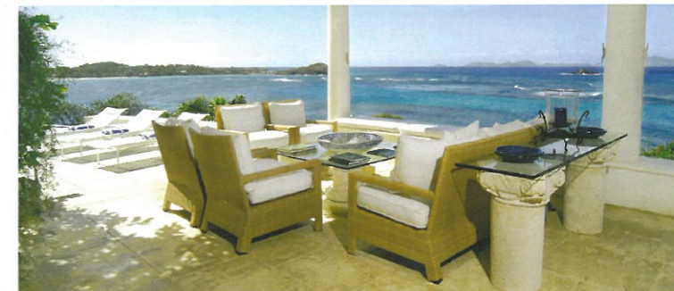
VILLA L'ANSECOY, MUSTIQUE